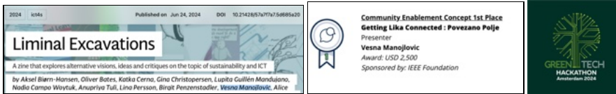
^^^Zine, grant, hackathon