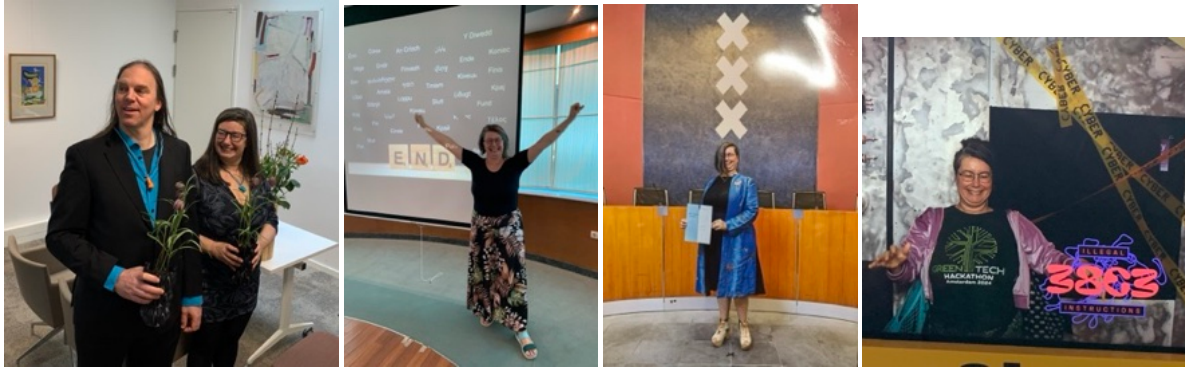
^^^ Wedding; The End; becoming Dutch; at 38C3